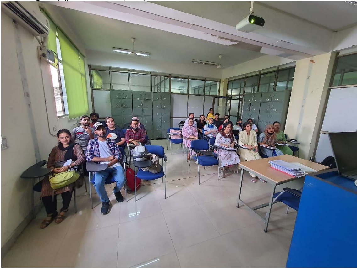
Lecture theatre with ICT facilities